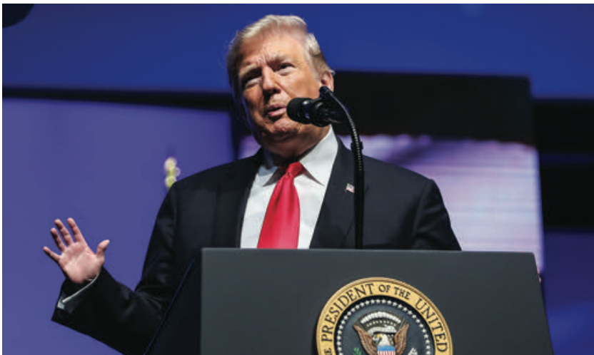
Figure 4. Trump small hands caricature.

The origin of this reflexively politically incorrect and somewhat benevolent slur-turned-typeface can be traced back to the late 1980s, when Graydon Carter—then editor of the New York satirical magazine Spy —published the first critique of the size, shape, and proportionality of Donald Trump’s hands. More than twenty-five years later, this seemingly arbitrary line of critique resurfaced to feature prominently in the Republican primaries. In 2016, Senator Marco Rubio made a comment that linked the (allegedly diminutive) size of Trump’s hands to both the size of his phallus and the deficiencies of his character (see also Hall et al. 2016, 76). During an early campaign speech, Rubio attempted to rile up a crowd with an innuendo: “And you know what they say about men with small hands [meaningful pause], you can’t trust them!” Trump responded in kind, dedicating several minutes of a campaign rally to a refutation of the accusation. As he did during his first press conference as president-elect, theatrically pointing to a stack of manila folders placed on the table next to the podium as a way to give physical evidence of his commitment to distancing himself from his business interests (see Hodges 2017a, 2017b), Trump responded to the allegations