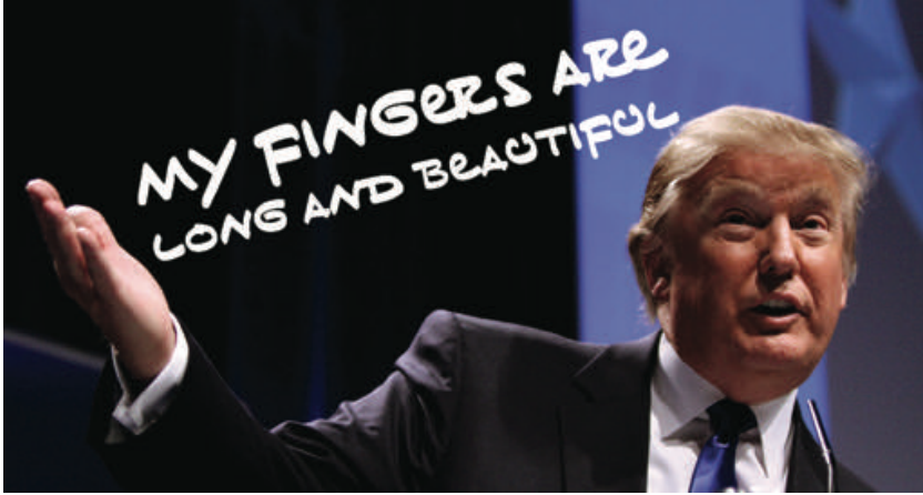
Figure 6. Tiny Hand as American StioB, targeting the inappropriateness of Trump's comments through the silent materiality of the typeface.

semiquote of Trump's words and thoughts and enables its users to highlight Trump's deviant metapragmatic behavior and the absurdity of his political positions and thought processes. In alignment with a regime of visual evidentiality where information acquired through seeing (the manila folders, the large hands, etc.) is made ideologically salient, Tiny Hand users deploy the font to provide physical evidence of Trump's stylistic and semantic inappropriateness and thus make the incredible tangible. As a mediatized graphic artifact circulating in a potentially endless variety of contexts, the font thus becomes a semiotic framework for articulating multidimensional and cross-modal commentaries on Trump's political message and persona.