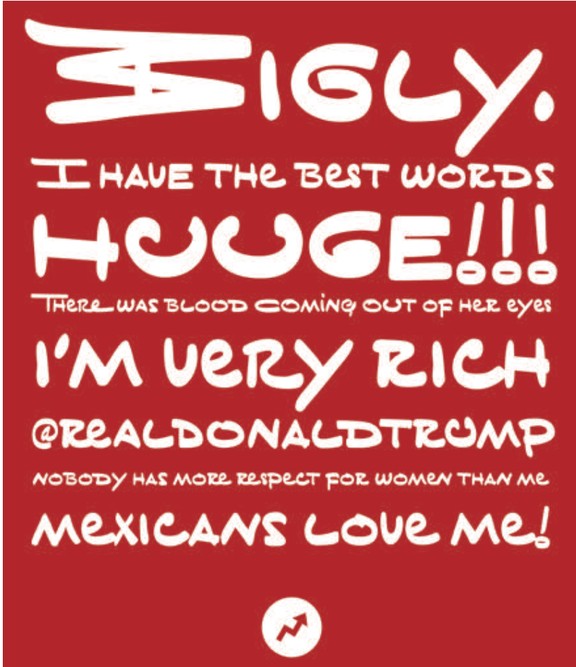
Figure 8. BuzzFeed's Tiny Hand graphics did not only stylize Trump's handwriting, but also stylized his voice through the reproduction of his signature utterances. Courtesy of Mark Davis.

itself as a way to evoke his voice. The creation of Tiny Hand presumes the recognition of Trump's handwriting. To aid this recognition, designers used formulas typical of Trump's linguistic style. Within the American liberal public, the use of these utterances instantly renders the graphic artifacts (and, thereby, the font) indexical of Trump.