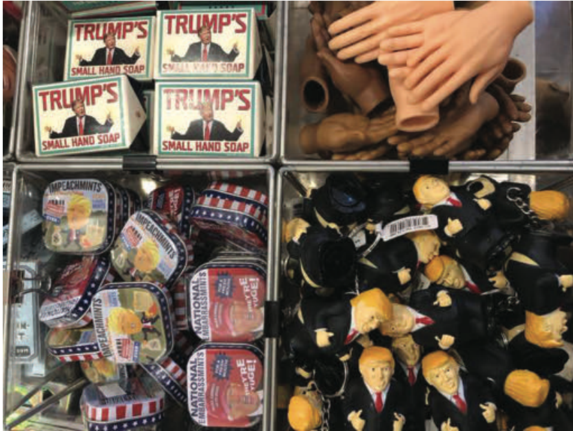
Figure 9. Anti-Trump gadgets for sale in a NYC gift shop: “Trump’s Small Hand Soap for Dirty Politics,” Tiny Hand pencil toppers, Trump poop key chain, “National Embarrassmints” and “Impeachmints.”

ideologies may offer an interesting domain of investigation—one that blurs the boundaries between the linguistic and the material.