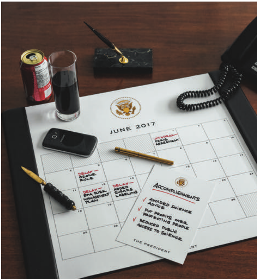
Figure 7. Trump’s dangerous agenda, as imagined by Union of Concerned Scientists. (design by Allison Slattery/House 9 Design).

Typeface choices are never neutral but are inevitably “complicit in a range of cultural projects along various affective, ideological, and even political dimensions” (Murphy 2017, 66). Tiny Hand is no exception. However, unlike the